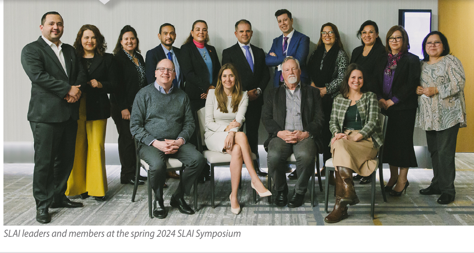
SLAI leaders and members at the spring 2024 SLAI Symposium

2024 was a breakout year for the SWOG Latin America Initiative (SLAI). SLAI enrollment to NCI trials has soared, and SLAI member sites took spots on our lists of top accruals and top-performing institutions. Most of our research committee rosters now include Latin American investigators, several of whom have trial concepts in development within those committees. The year also saw the first significant SLAI collaborative efforts in hematology, and the first SLAI co-chair on a SWOG trial in development (S2505).